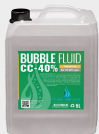
Drums 2,5L – 5L – 10L – 20L 200L -1000L