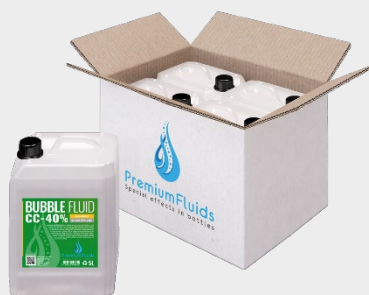
Boxes 6x2,5L – 4x5L