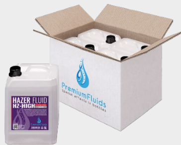
Boxes 6x2,5L – 4x5L