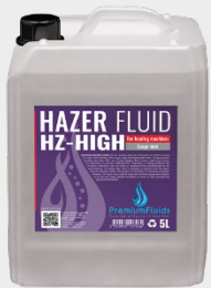
Drums 2,5L – 5L – 10L – 20L 200L -1000L