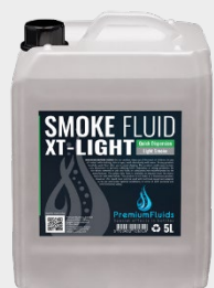
Drums 2,5L – 5L – 10L – 20L 200L -1000L