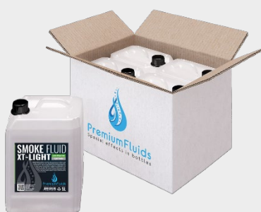
Boxes 6x2,5L – 4x5L