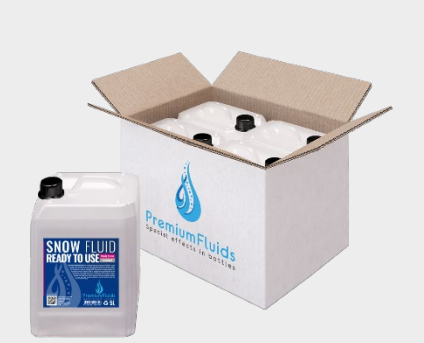
Boxes 6x2,5L - 4x5L