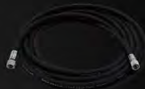
\ Branch Hose 3/8 DN10