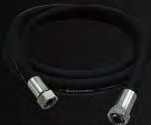
\ Main Hose 1¼ DN32