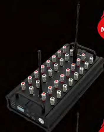
\ PyroSlave X16